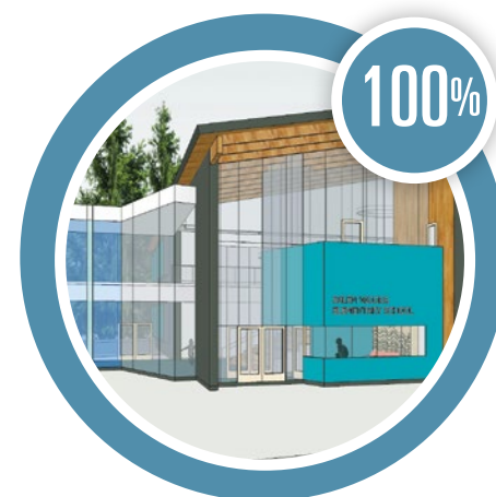
Salem Woods Elementary modernization