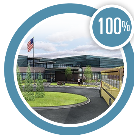
Park Place Middle School modernization